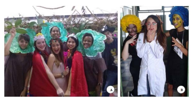
Figure 3A and B: Application of playing educational actions concerning parasitic endemics.

conversations about parasites were made to attract attention and build knowledge. As a result, great mobilization and interaction were seen, showing interest in the subject and confirming the knowledge received during questioning (Figure 3A and B). When reported on popular names of enteroparasitoses and hygiene habits, a certain prior understanding was evidenced. However, many said they were not adept at such habits that protect from parasitic diseases.