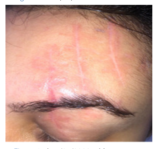
Figure 9: Aug/17/2020 - After treatment