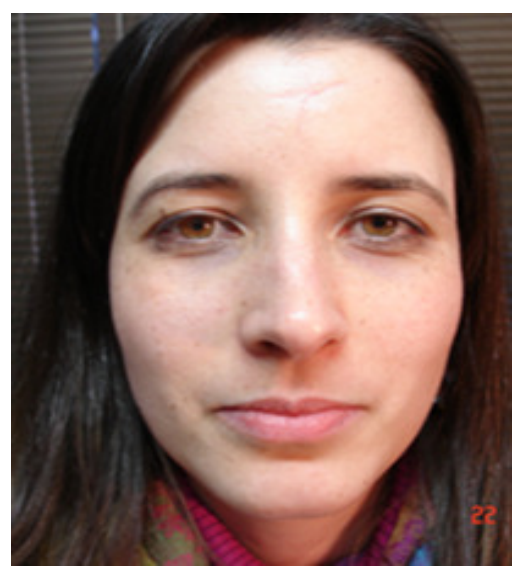
Figure 2: August 22<sup>nd</sup>, 2011 – Four months after the accident. After treatment