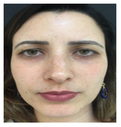
Figure 3: November 2019 – Eight years after the accident. After treatment