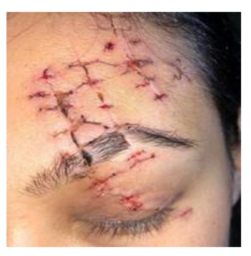
Figure 7: Mar/7/2020 – Wound after stitch removal