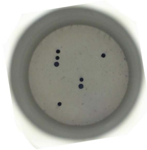
Figure 1: This image shows a negative result and the controls to monitor. B: hybridization control indicates that the hybridization process worked correctly. C: endogenous amplification control ( \beta -globin) indicates that the amplification worked correctly, and the clinical sample contains human DNA.