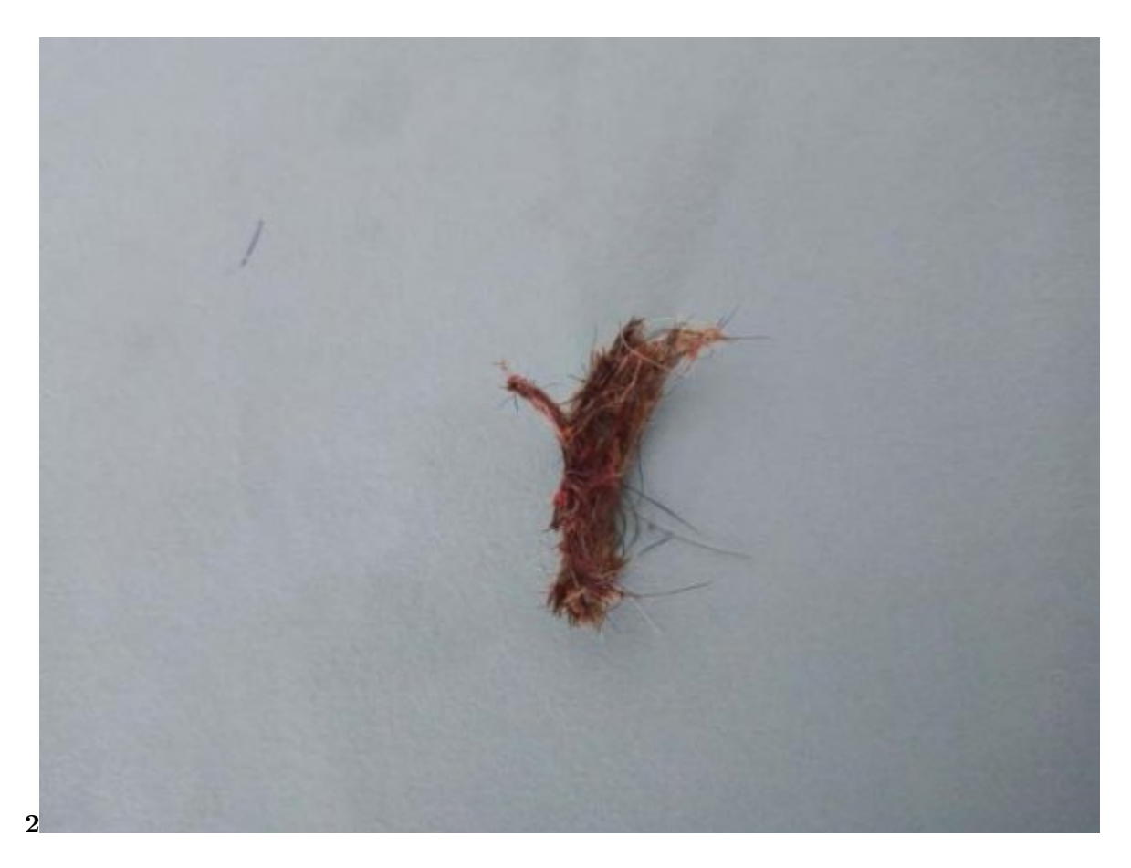
Figure 2: Fig. 2