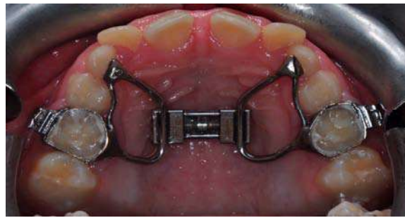
Figure 2: RPE Device

Kim et al., in a 2022 clinical study, assessed changes in respiratory function related to increased upper airway volume in patients with OSA treated with RPE. In all 26 cases treated, there was an increase in the size of the nasomaxillary complex, with improvement in parameters related to OSA: there was a reduction in AHI and oxygen saturation values, and snoring had markedly improved [88] (Figure 2).