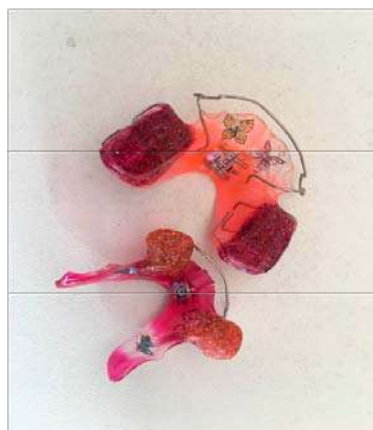
Figure 3: Twin Block Device

Ghodke S. et al., in a study conducted in 2014, analyzed the impact of TB appliance on the anatomy of pharyngeal airway passage (PAP) in a group of class II malocclusion patients in an age range of 8 to 14 years. They stated that, for class II malocclusion subjects, the TB appliance to treat mandibular retrusion enhanced PAP dimensions while maintaining the same pre-treatment posterior pharyngeal wall thickness. Consequentially, by removing predisposing factors and adaptive alterations in the upper airway during infancy, class II correction using a TB device may help lower the likelihood of developing OSA as an adult [91].