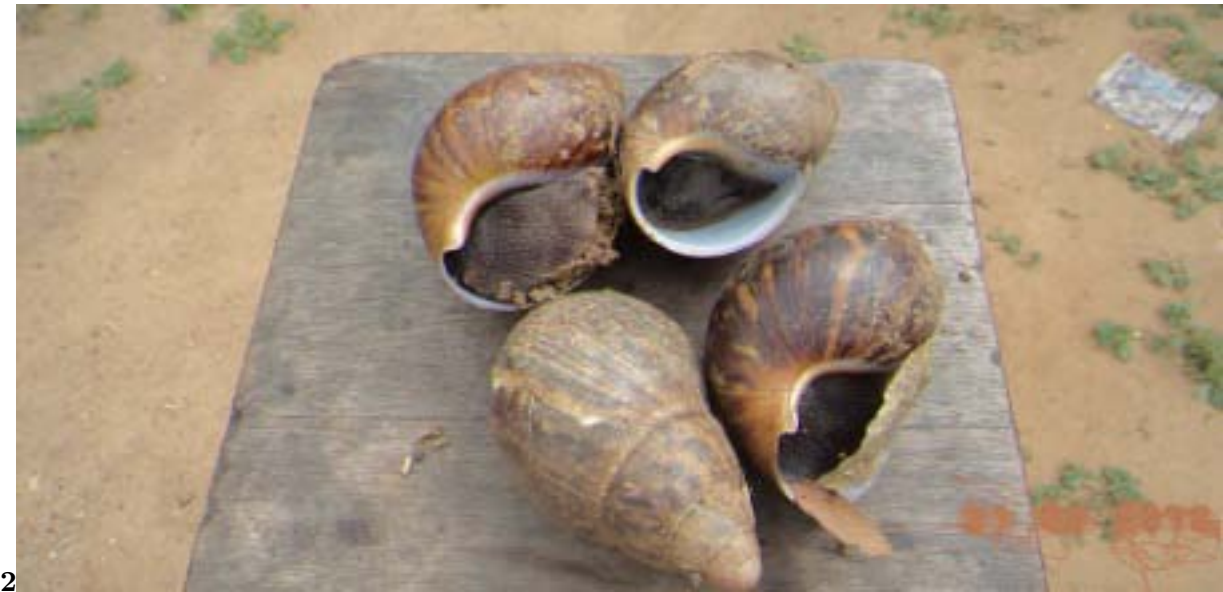
Figure 5: Fig. 2 :