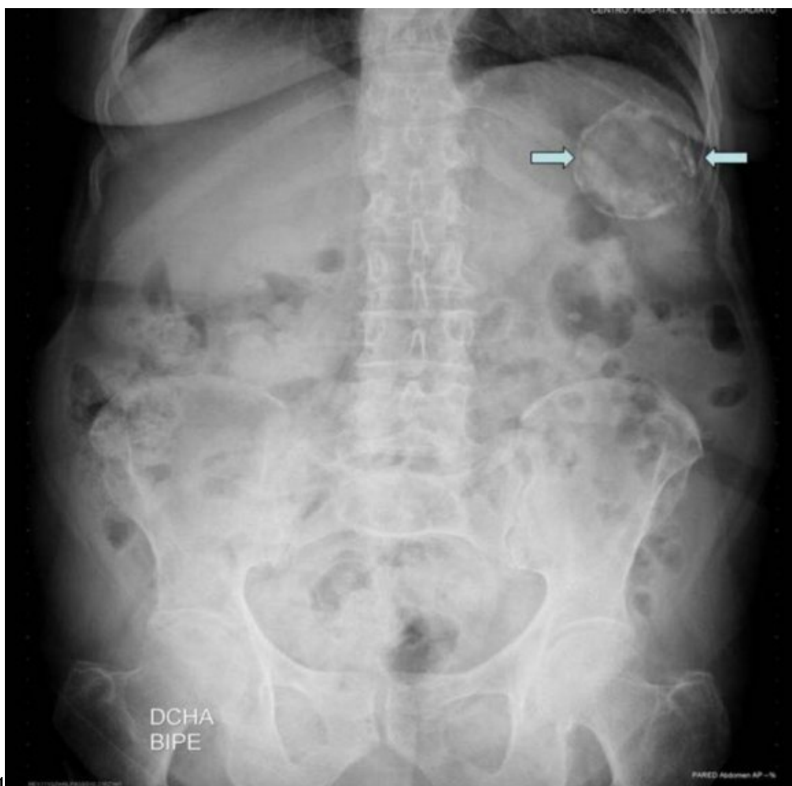
Figure 3: Figure 3 :Figure 4 :