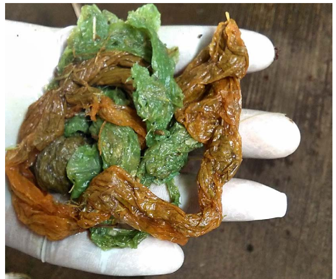
Figure 2 and 3: Plastic, cloth and rope removed from rumen of three years old sheep