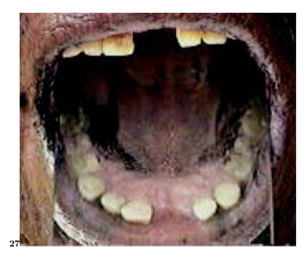
Figure 1: T 2 - 7.