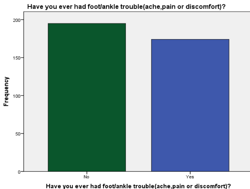
Fig. 1: Have you ever had foot/ankle trouble (ache, pain, discomfort)