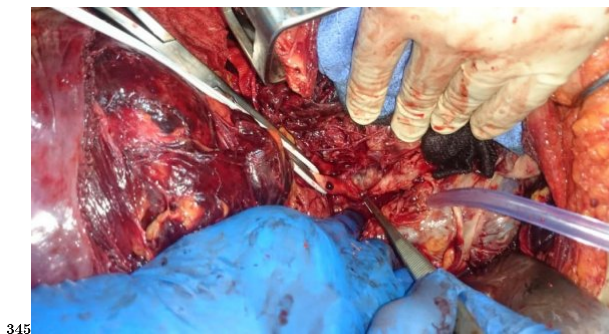
Figure 2: Fig. 3 :Fig. 4 :FFig. 5 :