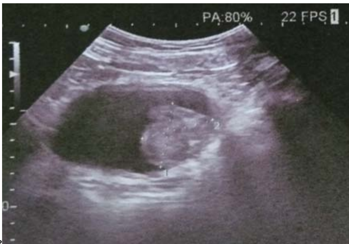
Figure 1: Fig. 1 :Fig. 2 :