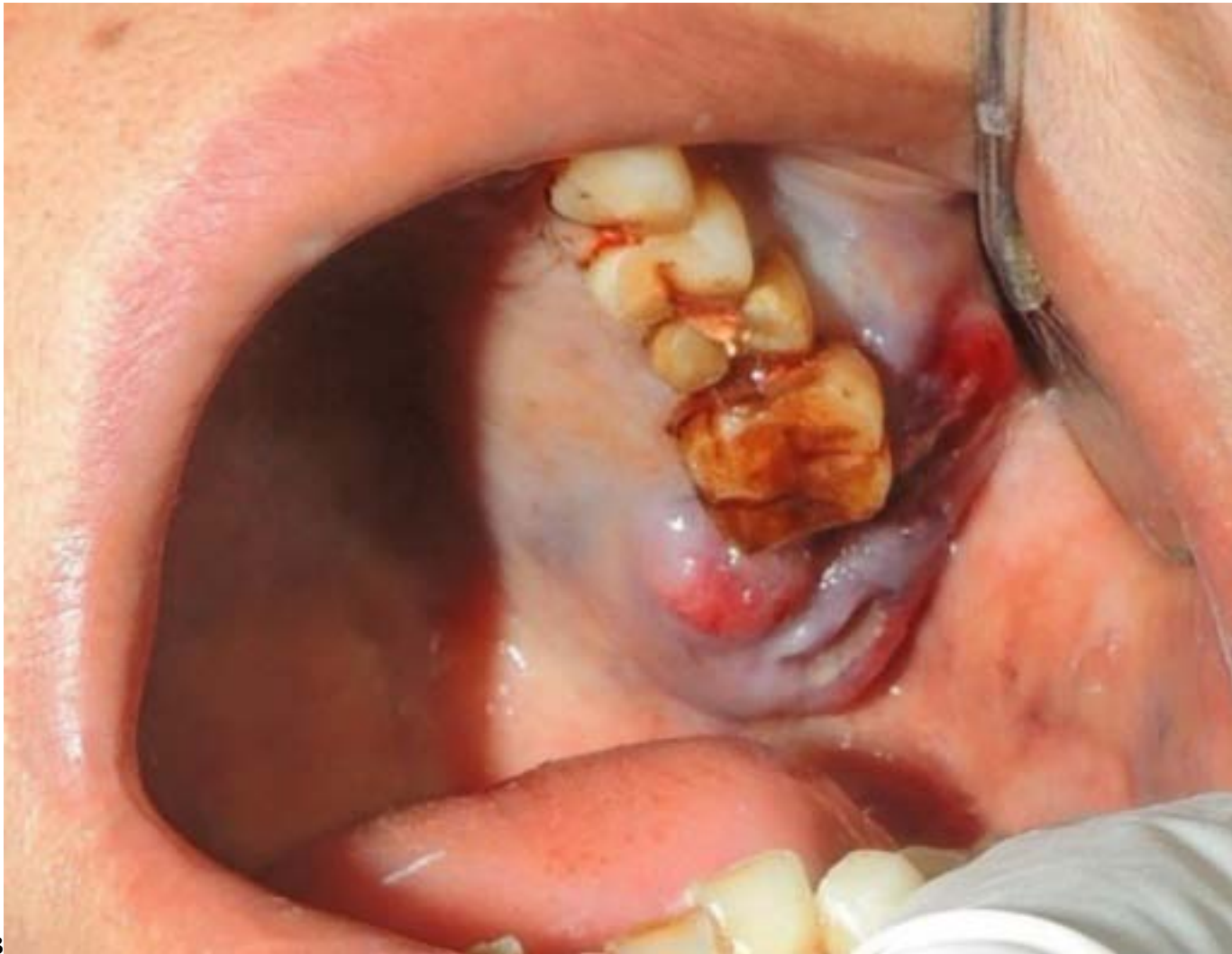
Figure 2: Fig. 2 :Fig. 3 :