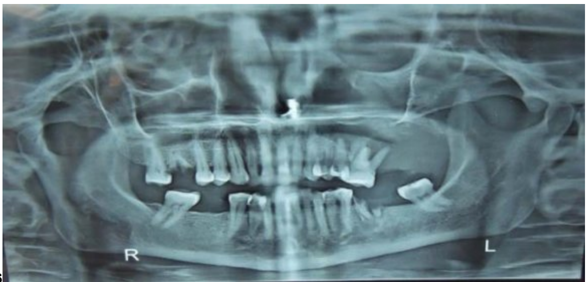
Figure 3: FigFig. 4 :Fig. 5 : 6 :