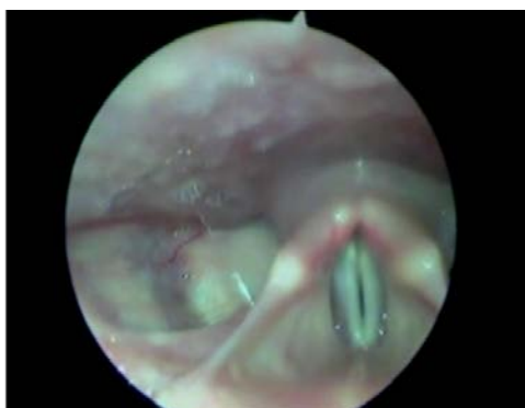
Picture 2: Arytenoid specimen