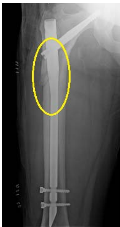
Figure 2: X-ray of the right femur on day 0 post-op showing an iatrogenic fracture of the proximal third of the femoral shaft