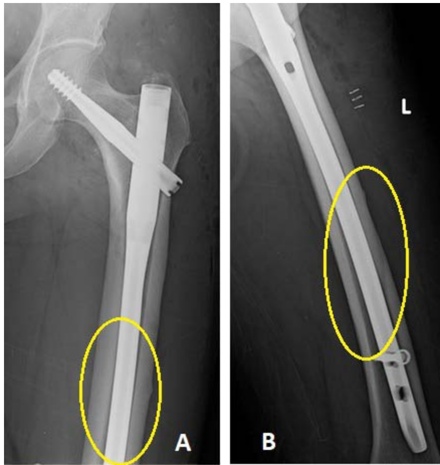
Figure 4: A, B: X rays of the left femur on day 0 post-op showing an iatrogenic fracture of the distal third of the femoral shaft