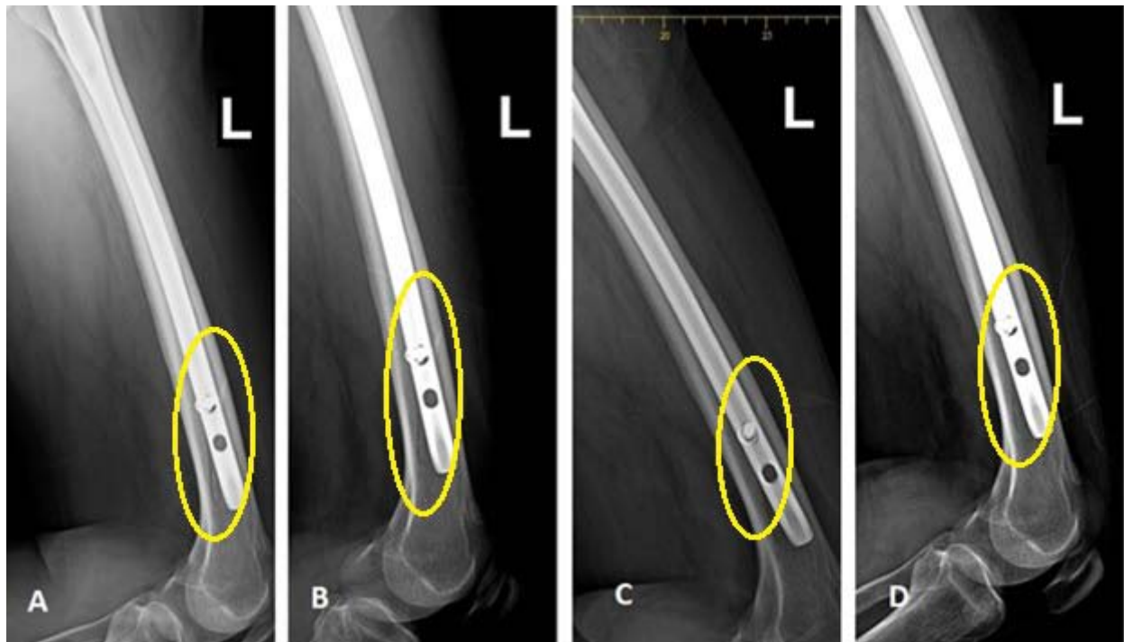
Figure 5: X rays of the left femur; A: week 6, B: week 10, C: week 16, D: week 23.