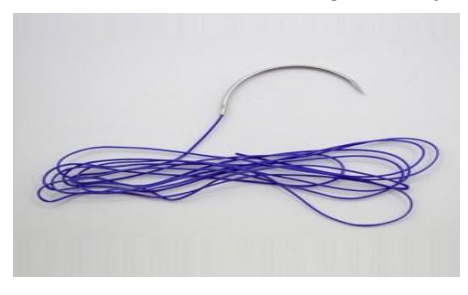
Figure 1: Surgical suture