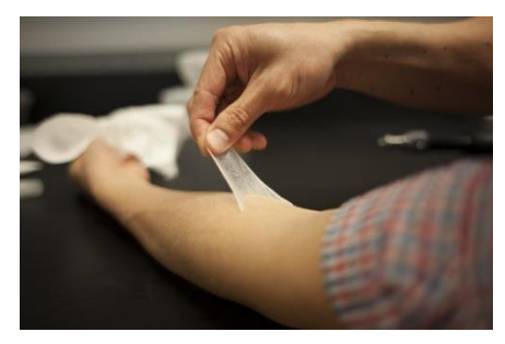
Figure 2: Artificial skin

Traditional ways to dealing with losses of the skin grafts from the patient (autografts) an unrelated donor cadaver. The former approach has the disadvantage that there may not be enough skin available, while the latter suffers from the possibility of rejection or injection until the late twentieth century skin grafts constructed from the patient skin. This method created a problem when the skin had been damaged extensively, making it impossible to treat severely injured patients entirely with outgrafts.