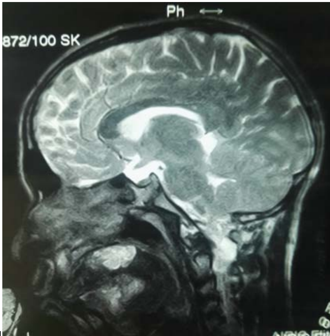
Figure 1: Figure 1 :

52 The standard treatment for neurofibromas has been surgical excision and the diagnosis can only be confirmed by 53 histological examination. Neurofibromas have extensive vascularity and tend to bleed during surgery. Therefore, 54 excessive bleeding should be kept in mind while attempting surgical removal [3]. Early diagnosis in such a 55 patient is very important and these patients need regular follow-up during their lifetime to detect recurrences. 56 Fortunately, there were no signs of recurrence or other manifestations during the follow-up period of our patient until that date.