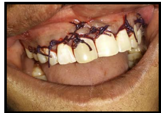
Fig. 10: Primary closure