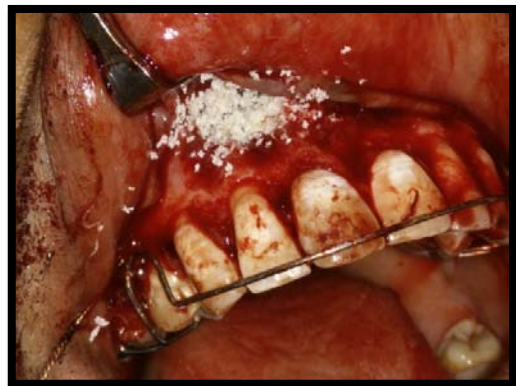
Fig. 9: Showing graft filled into defect