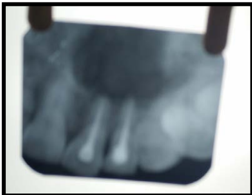
Fig. 3: IOPA showing ill defined radiolucency