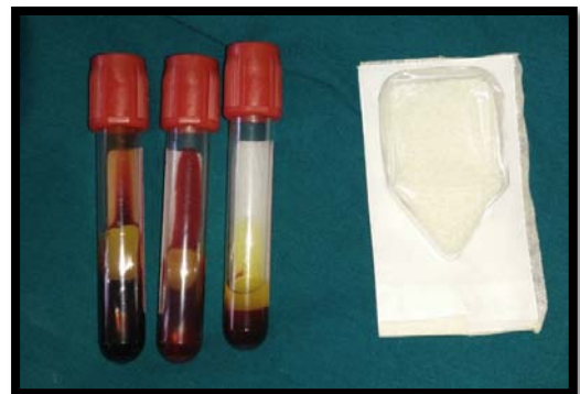
Fig. 6: Showing PRF and graft