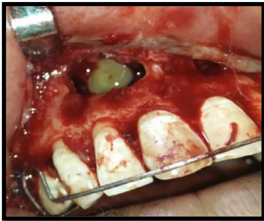
Fig. 8: PRF filled in the labial defect