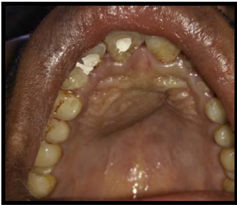
Fig. 2: Palatal swelling