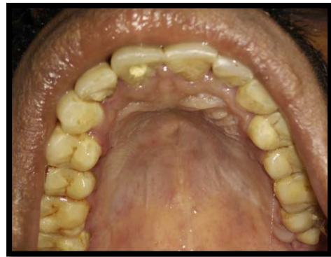
Fig. 12: Post operative image of palate