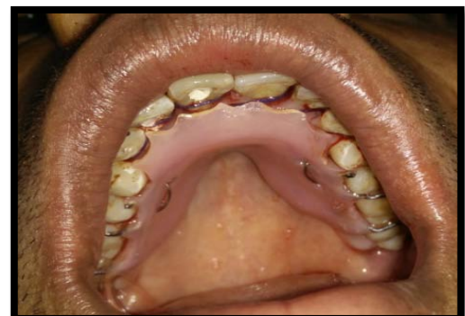
Fig. 11: Retainer placed palatally