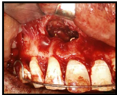
Fig. 7: Showing labial perforation