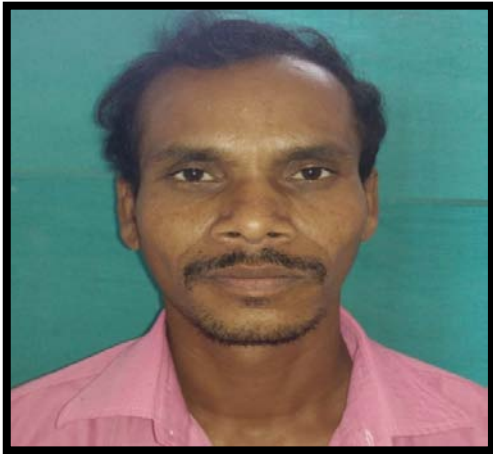
Fig. 1: Front profile of patient

Histopathological features were suggestive of a clinical diagnosis of an infected radicular cyst. Suture removal was done after a week and a palatal plate was given. The patient was kept under regular clinical and radiographic follow-up. After one month of follow-up, oral and radiological examination revealed healing wound and reduction in the size of radiolucency.