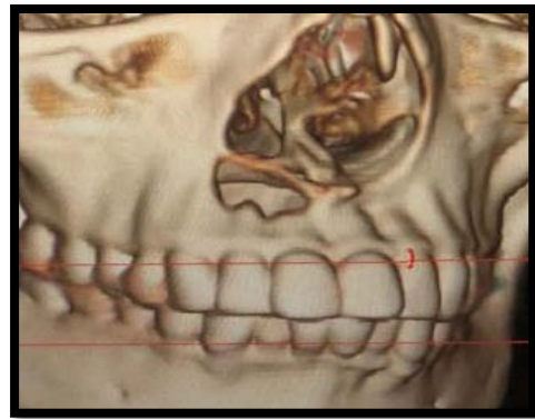
Fig. 4: CT image showing labial perforation