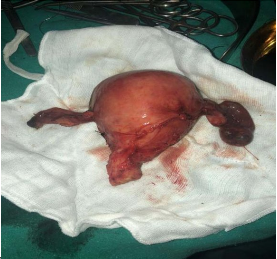
Figure 1: A Fig. 1 - 5 :

Giant endometrial polyp, as seen in this case, are exceedingly rare variants of classical polyp. Associated with hematometra. To the best of my knowledge, this is a rare case of postmenopausal women with giant endometrial polyp with hematometra with old healed endometriotic lesion.