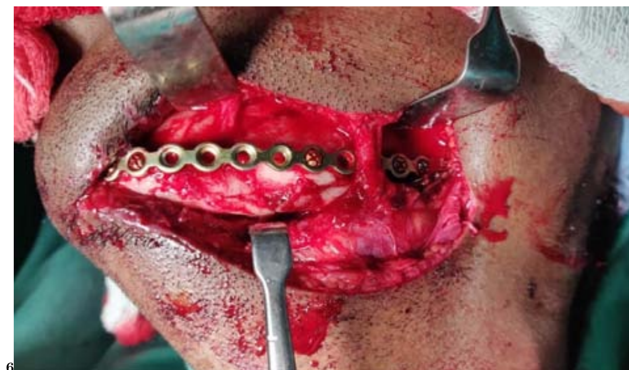
Figure 5: Figure 6 :