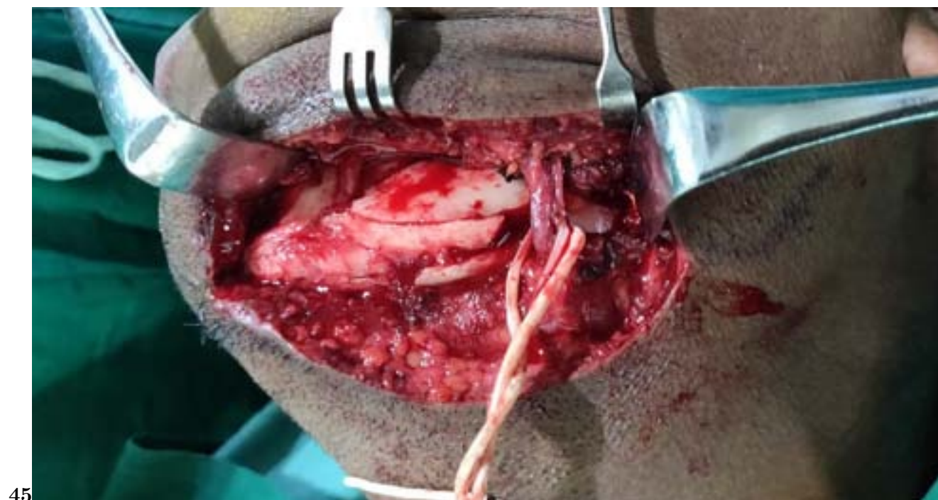
Figure 4: Figure 4 :Figure 5 :