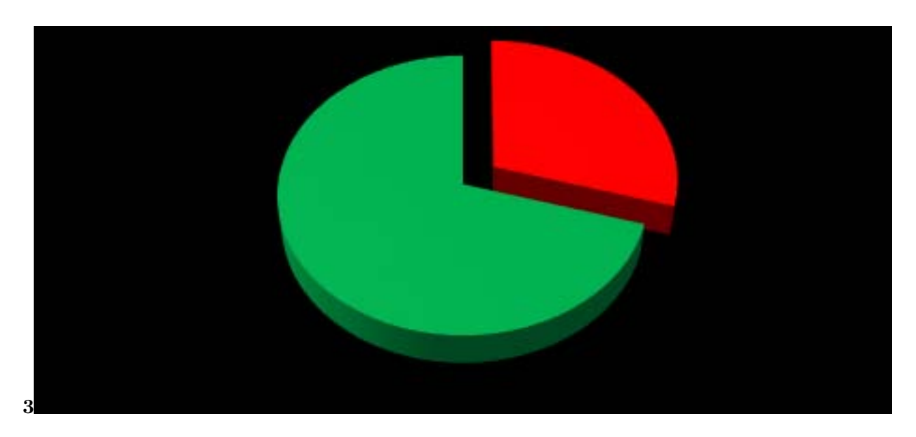
Figure 4: Figure 3: