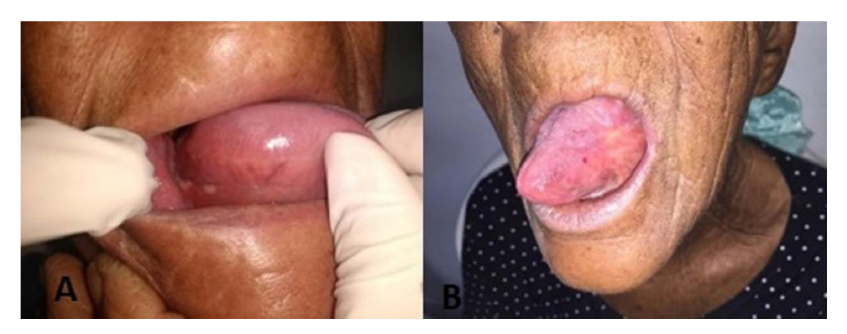
Figure 3 (A and B): Clinical aspect of the oral mucosa in the last week of radiotherapy treatment, showing recovered mucosa and absence of painful symptoms.