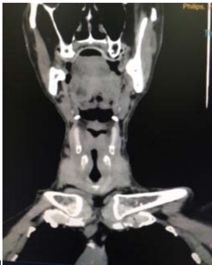
Figure 1: Figure 1 :

Even though stridor post decannulation is commonly due to tracheal stenosis, tracheomalacia dynamic pharyngeal collapsibility should also be considered as a potential cause. A video-assisted bronchoscopy aids in the detection of the dynamic collapse. 1