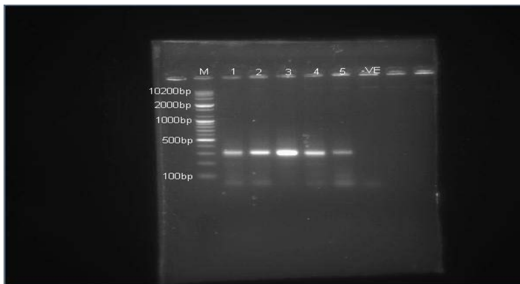
Figure 1: Gel image for amplified DNA of ticks

electrophoresis of the PCR products, all the five (5) tick species were positive and yielded products of approximately 323 bp. (see plate 1.0).