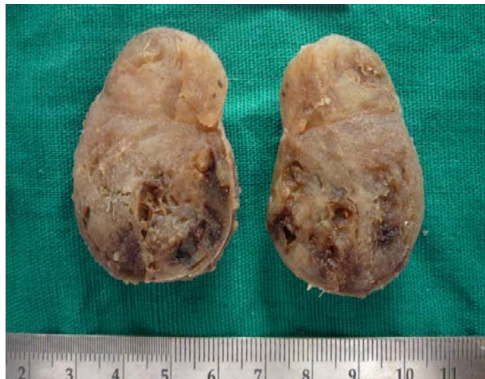
Figure 2: Gross specimen: A solid well circumscribed soft tissue specimen, creamish-brown in colour, rubbery in consistency measuring about 4.8 x3.5 cm. Cut surface shows areas of cystic degeneration and haemorrhage

Excisional biopsy revealed a solid soft tissue specimen measuring about 4.8 x3.5 cm; well circumscribed, creamish-brown, rubbery in consistency. Cut surface showed areas of greenish jelly, hemorrhage and cystic degeneration.