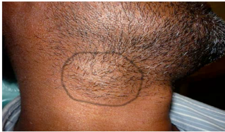
Figure 1: Clinical image: Extra-oral cervical swelling of about 3x2 cm, evident in the submandibular region about 4 cm below the inferior border of the mandible

Intraorally, there were no contributory findings. Complete blood investigation revealed all values to be within the normal range. Thyroid hormone (TSH) levels were well within limits. A provisional diagnosis of cervical lymphadenopathy suspected to be associated with tuberculosis was made and the lesion was surgically excised.