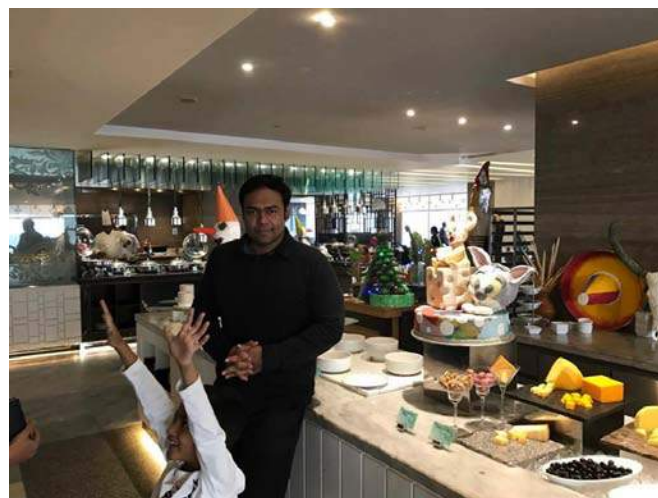
Figure 2: The Author