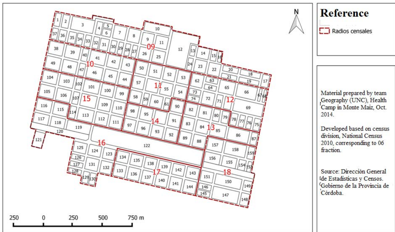
Figure 1: Figura 1 Map of Monte Maíz census radii by National Institute Census divide the town in nine sectors outweighed demographically.

The presence or absence of asthma was recorded not according to existing medical diagnosis, but rather in accordance with ISAAC's previously validated survey instrument (15). ISAAC's questionnaire is based on questions such as whether the respondent experienced wheezing in the last year, or use of bronchodilator aerosols. This study's implementation of ISAAC's survey instrument facilitates comparison between the data generated elsewhere by ISAAC and the data generated in Monte Maíz.