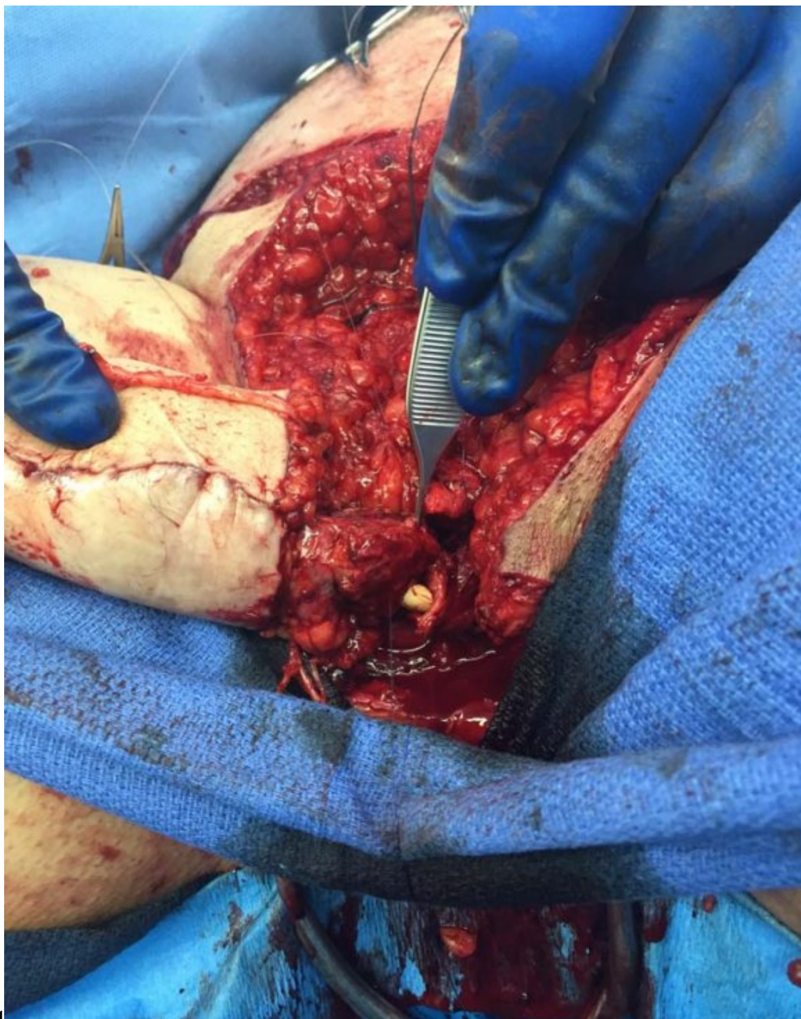
Figure 8: Figure 4 :