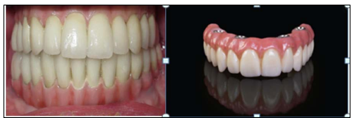
Fig. 3: PFM Vs Hybrid Prosthesis after Full Mouth Implant Therapy

Hybrid prosthesis- An alternative option in such situations is the hybrid prosthesis. Because acrylic acts as an intermediary between the porcelain teeth and metal substructure, the impact force during dynamic occlusal loading also may be reduced. Hence, hybrid prostheses are indicated for implant restoration in large crown height spaces as a general rule.8