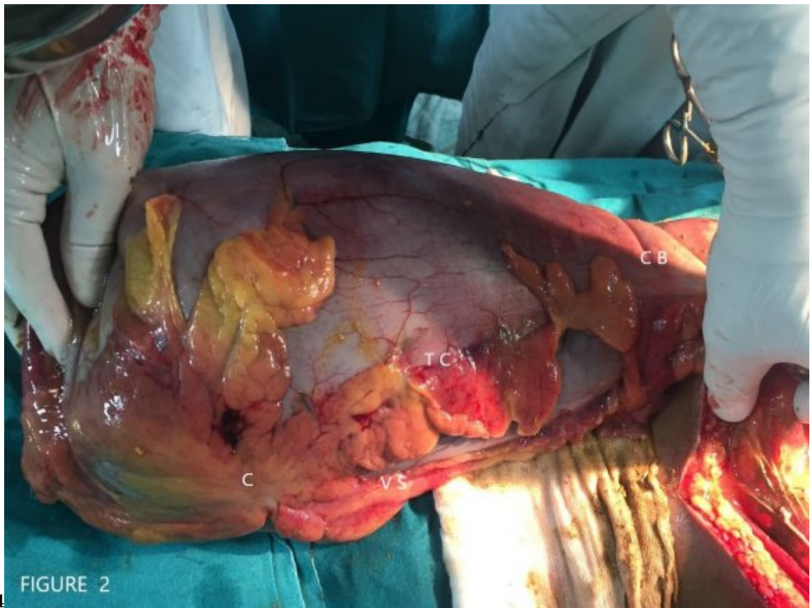
Figure 3: Figure 4 :