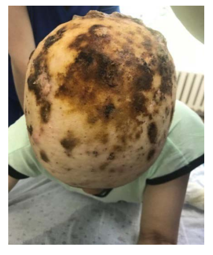
Fig. 2: The scalp at admission.