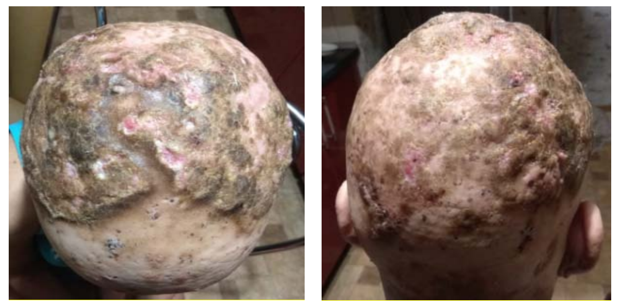
Fig. 5: After surgery: rear view and lateral view.

In the postoperative period, the patient received antibacterial (Cefazolin 1gh3 p, IV) and antihistamine (Suprastin 1,0x2 p,IV) therapy, local silver-containing dressings, and physiotherapy (UHF). During daily dressings, elements of keratosis were removed with a Volkmann spoon, non-viable skin areas were excised, and abscess cavities were flushed with an antiseptic solution (Chlorhexidine 0.05%). The pus-like discharge from the wounds persisted for 7 days; the pain on palpation disappeared within 2–3 days; and no new foci of inflammation were noted. On day12, the patient was discharged in a moderate condition.