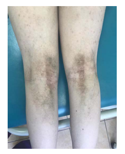
Fig. 1: Hyperkeratosis of the popliteal pits.

On examination, the patient was feverish (37.8°C). The skin was dry and with follicular keratosis. There was no growth of eyebrows and eyelashes. In the areas of the extensor surfaces of the elbow, knee joints, and the gluteal fold, the skin was thickened and pigmented. The skin of the parietal area was with multiple yellow-brown scaly overlays. Palpation revealed several painful and edematous infiltrates, some being with fluctuation. The clinical blood test showed the number of white blood cells to bear 10,2x109 cl/l. Urinalysis and blood biochemistry were normal.