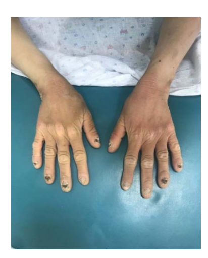
Fig. 3: Onychomycosis of the upper extremities.

The preliminary diagnosis was KID syndrome with multiple abscesses of the skin of the parietal region.