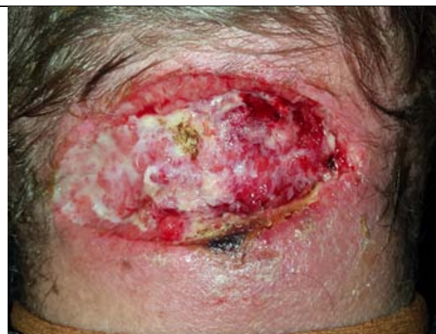
Pic 3: The state of the wound after the 3rd session of the CO 2 laser (5th day, after the opened abscess). There is no Fibrinous purulent exudate, there are signs of granulation on the wound.

Observation of the course of purulent wounds in dynamics showed that the cleansing of wounds from purulent-necrotic masses during the traditional treatment occurred on the days 7.0 \pm 0.5 (on the 4.5 \pm 0.5^{\text{th}} day in the main group I and 3.8 \pm 0.5 in the main group II), the appearance of granulations was noted on 7.5 \pm 0.7^{\text{th}} days (on the 5.0 \pm 0.6^{\text{th}} day in the main group I and 4.0 \pm 0.5 in the main group II), and marginal