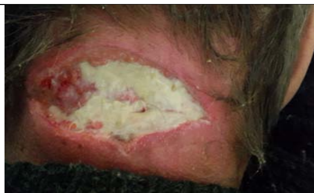
Pic 1: Carbuncle of the posterior surface of the neck after dissection. Fibrinous purulent exudate on the day of the wound.