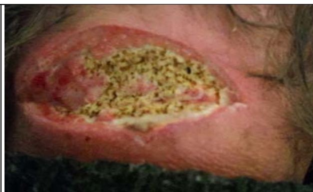
Pic 2: The state of the wound after the 1st session of the CO 2 laser