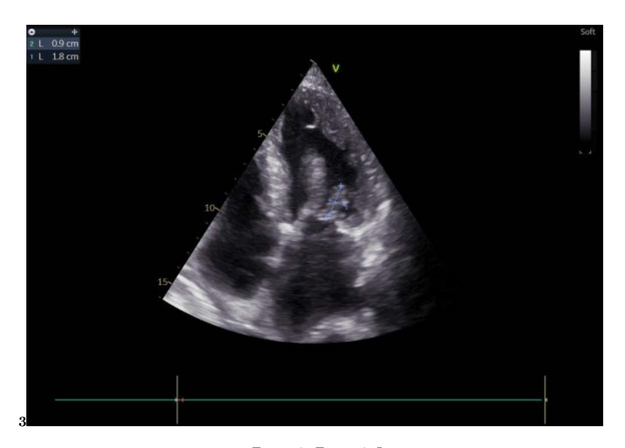
Figure 3: Figure 3:I