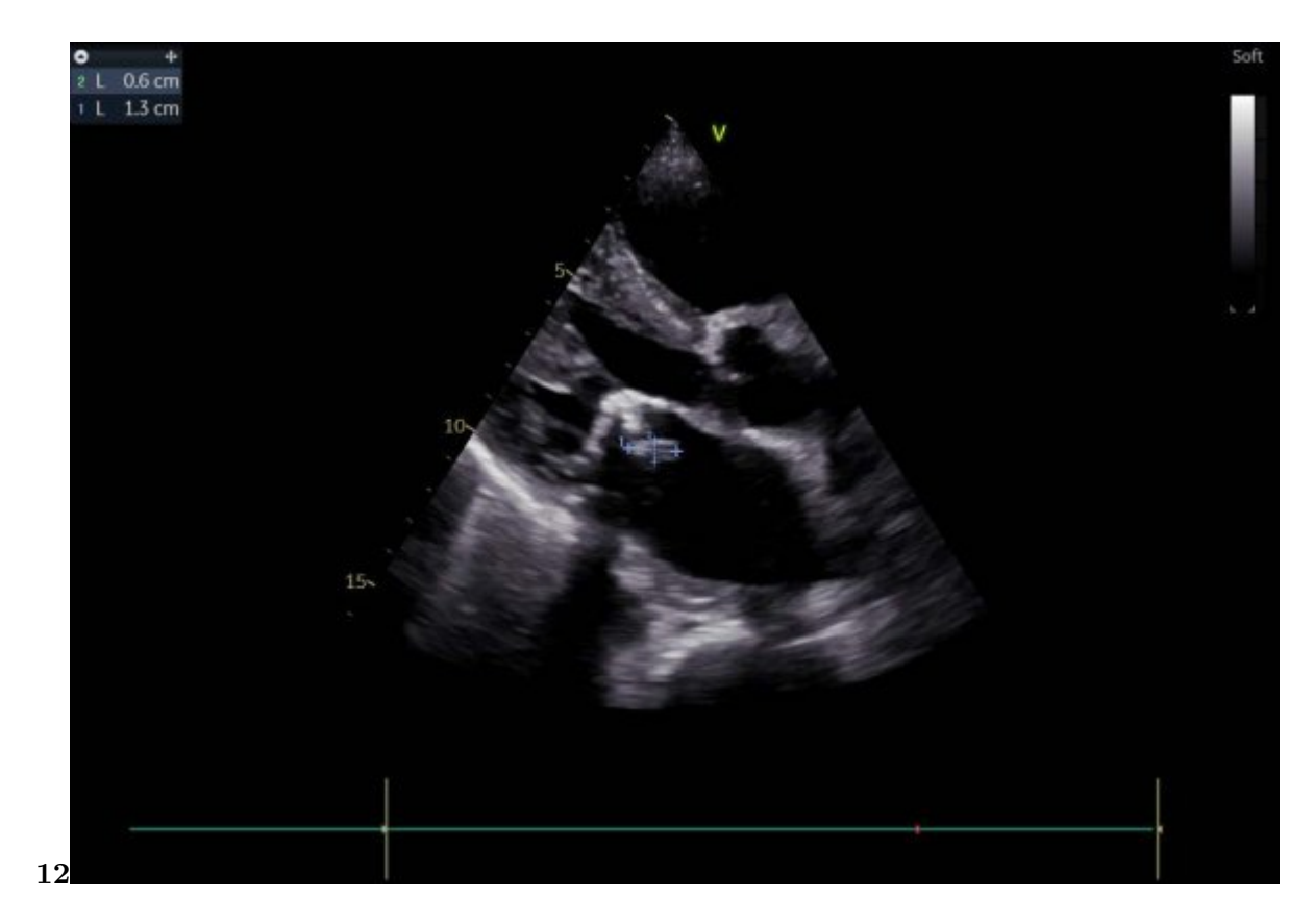
Figure 2: Figure 1: Figure 2: I