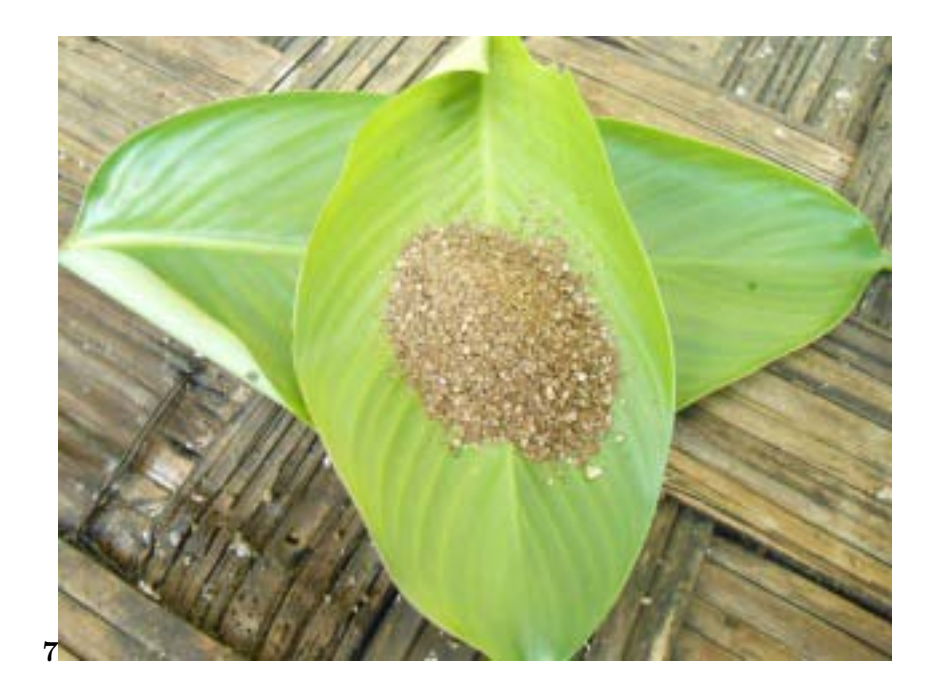
Figure 5: Figure 7: