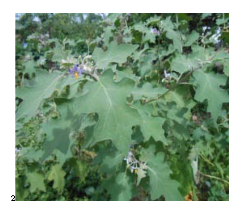
Figure 2: Figure 2: