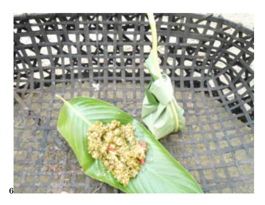
Figure 4: Figure 6: