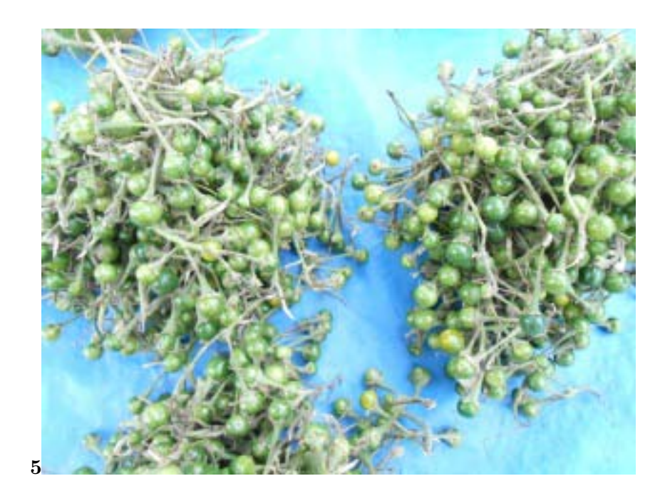
Figure 3: Figure 5: