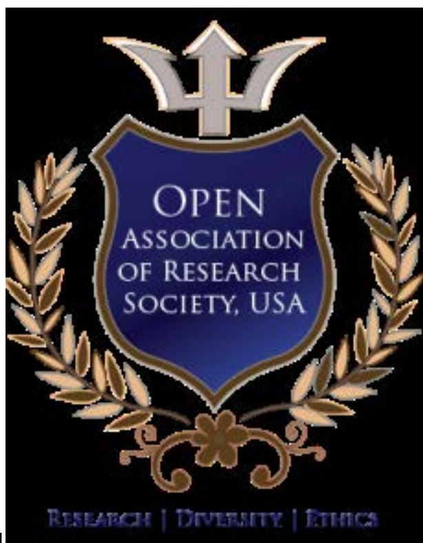
Figure 1: Fig 1 :

109 Mulberry is grown for sericulture practices in several centuries. Recent researches tell that mulberry has created 110 a new dimension that it has been cultivated even for human consumption because of its nutritive values and 111 its therapeutic properties as well as low cost and without any side effects. Instead of drug therapy, mulberry 112 leaves can be used as a natural diabetic treating herb. So that, mulberry farming can generate income for its 113 farmers not only through sericulture, when it is utilized for human consumption can also generate income for the mulberry farmers. 1