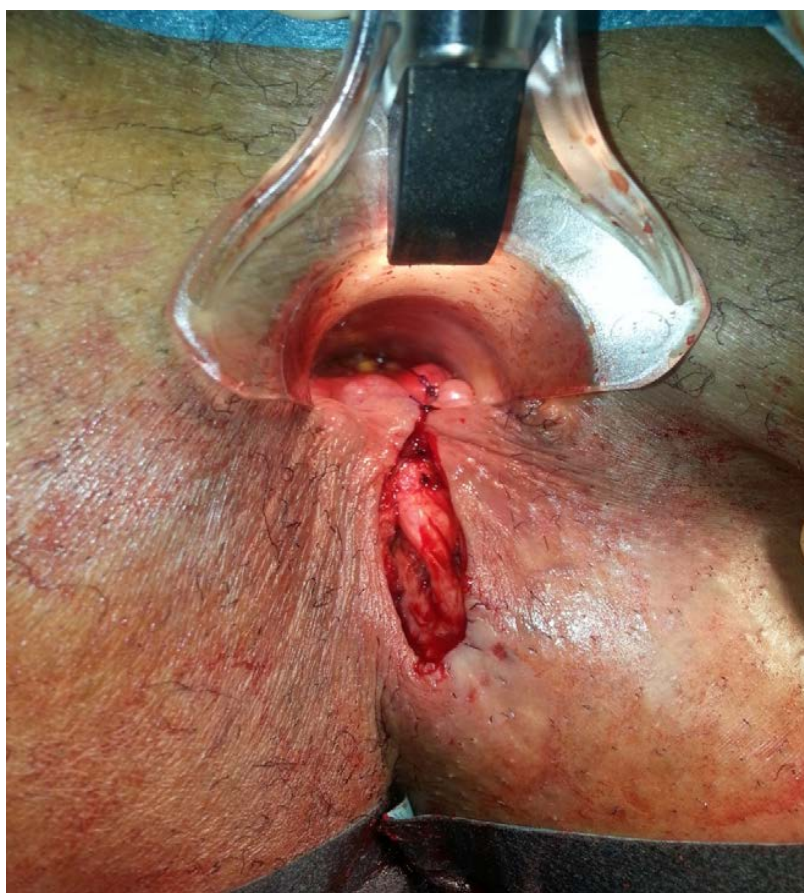
Figure 2b : After the sphincter repair