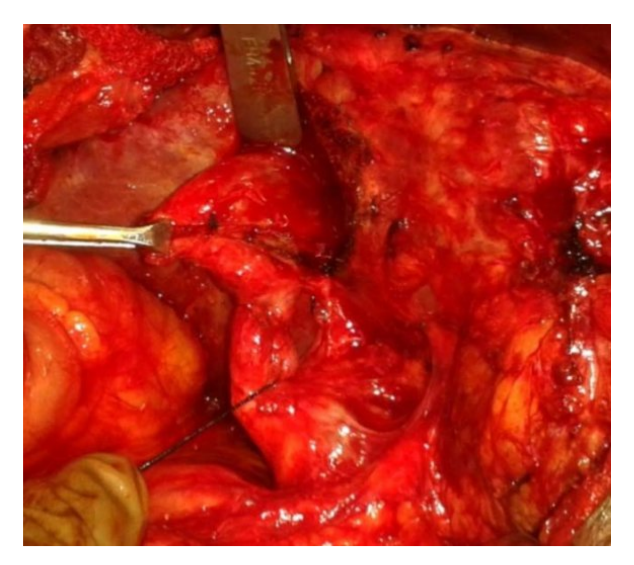
Figure 3: I

Symptomatic cystic duct stump lithiasis after cholecystectomy postcholecystectomy symptoms and