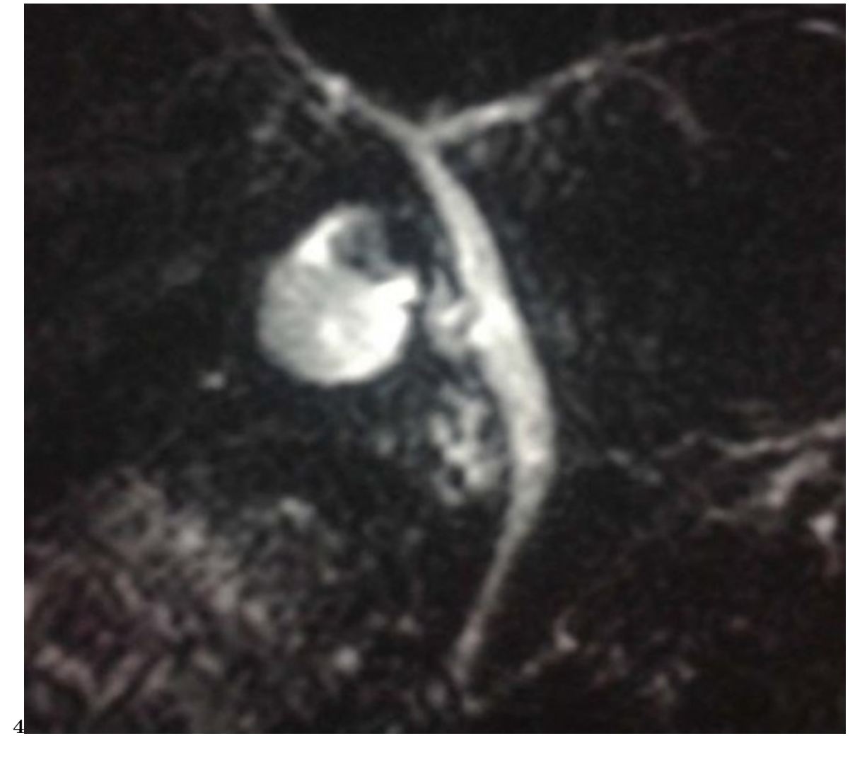
Figure 2: Figure 4: